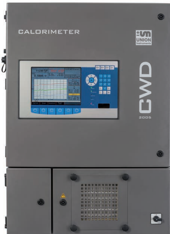
Figure 1: CWD2005 PLUS

Possible application areas are fuel regulation in refineries, the conversion of refinery gas or even the processes in the glass industry.