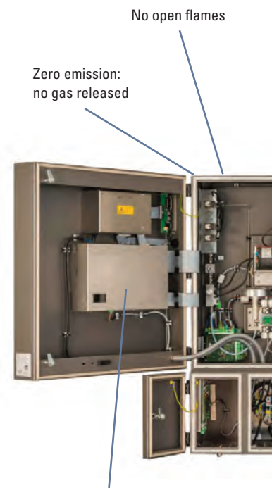
Temperature compensation by software

Best suited method to determine heating values of combustion gases is a Wobbe-type calorimeter which, in contrast to CARI-type calorimeters, measures the heating value of a gas mixture in BTU/scf directly without the need of applying correlation functions or using calibration gases and without any possible influence of catalytic burning effects.